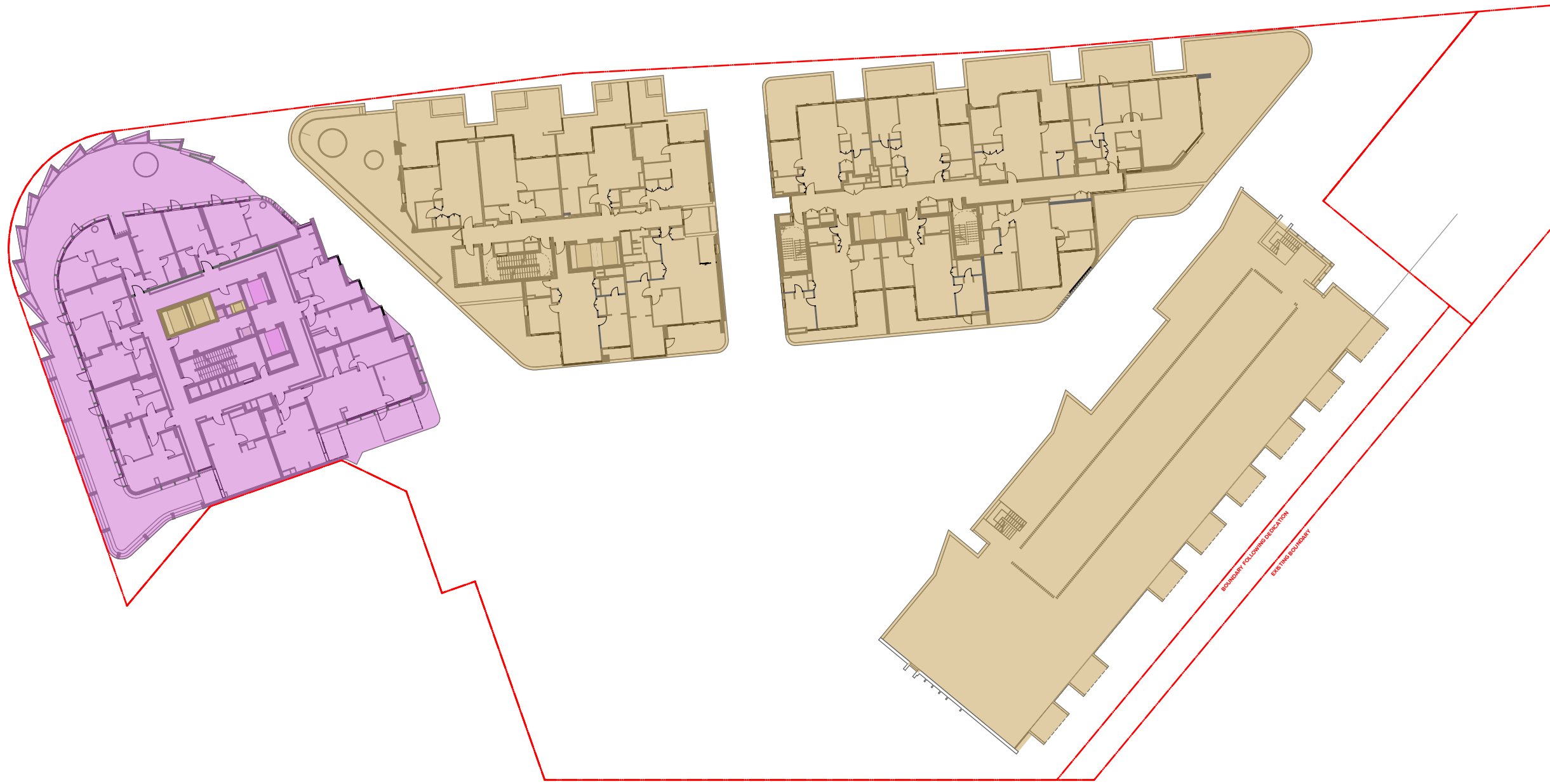
1 Level 03_APT_Hotel 1:500