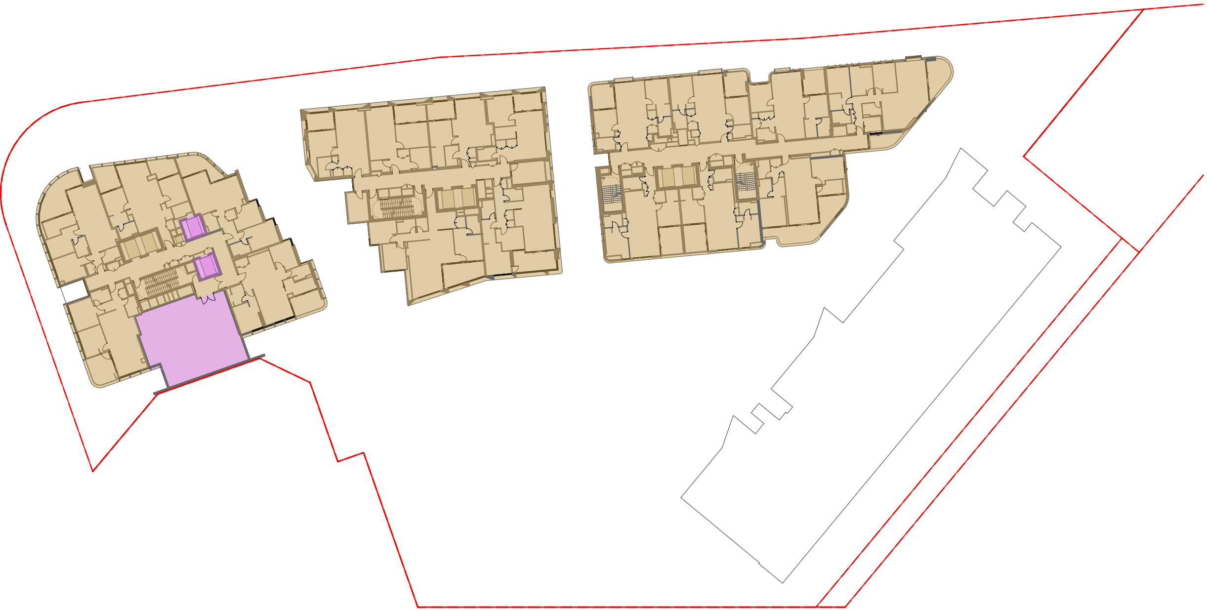
4 Level 07_APT_Hotel 1:500

Note: These plans are for information only and are not legal Strata or Stratum Plans